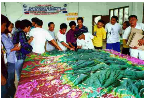
Figure 4 1:10,000-scale relief model of Mt. Malindang National Park and environs

On January 4, 2001 the Philippine Department of Environment and Natural Resources institutionalized Participatory 3-D Modeling by virtue of Memorandum Circular No. 1, S. 2001 as a process to be adopted in protected area planning and management.