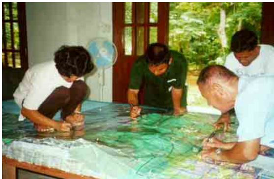
Figure 3 Information is extracted

In order to use the 3-D model for Participatory M&E or for combining thematic layers of different sources, the information has to be extracted and stored. In practice, whatever is displayed on the model is transferred to transparent, grid-referenced plastic sheets (Figure 3) in the form of points, lines and polygons. Attributes (non-graphic information like names, descriptions of land use or cover) are consigned to a legend. Plastic sheets and accompanying notes are handed over to the GIS, which digitizes, stores and edits